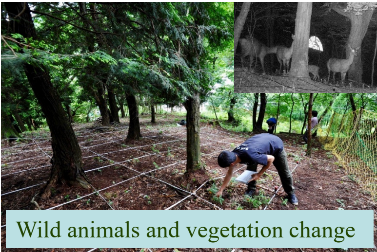
Wild animals and vegetation change