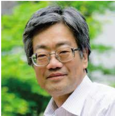
Shozo SHIBATA (Prof.)

Keywords: urban area, rural area, Satoyama, cultural landscape, landscape planning, biodiversity conservation, ecosystem management, nature restoration, revegetation