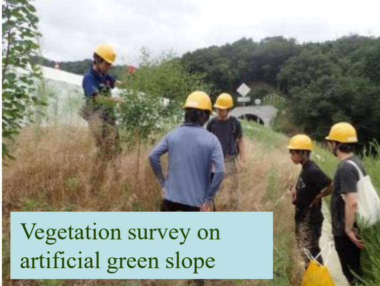
Vegetation survey on artificial green slope