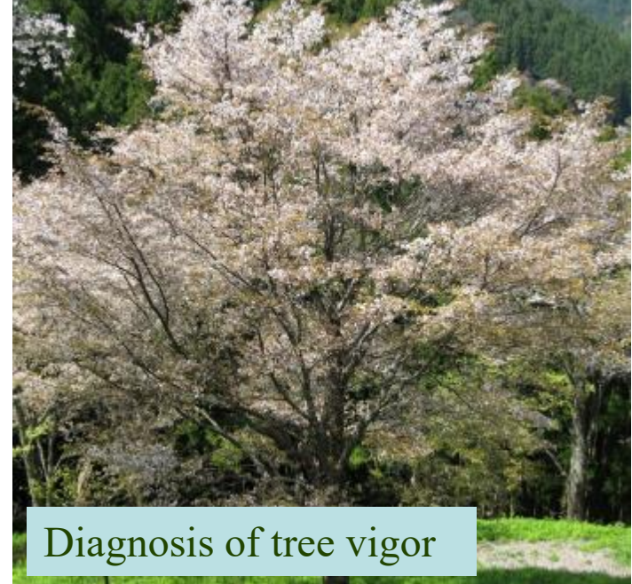
Diagnosis of tree vigor