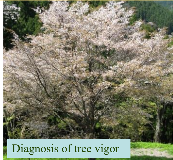
Diagnosis of tree vigor