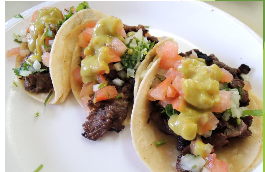
Bulgogi Tacos (a fusion dish of Korean and Mexican food)