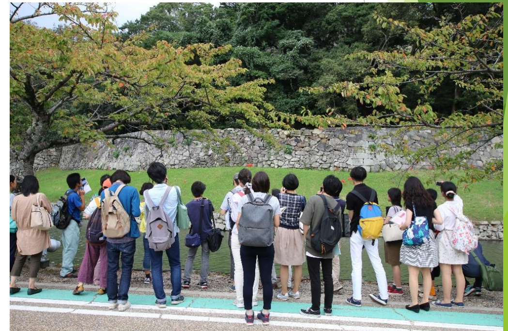
Field work on the Hikone castle