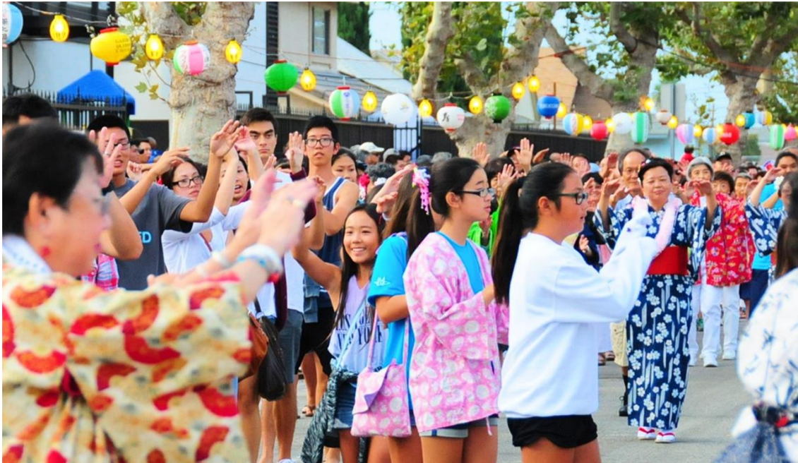
The Bon Matsuri in the ethnic Japanese community in Los Angeles

I am conducting historical research on immigration particularly in the United States from a transpacific perspective. My research aims to understand how local interethnic relations and international relations intersect and cause racial discrimination and economic inequality as well as how people with different ethnoracial backgrounds can nurture mutual understanding in an immigrant society. Applicants are expected to have studied U.S. history in undergraduate years.